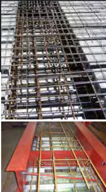
top: Internal beam and precast deck units prior to topping